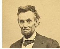
You Won't Believe Who's Related to Abraham Lincoln Ancestry.com