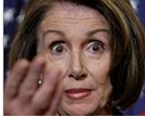
Constitutional Scholar: Pelosi is Dead Wrong Money Morning