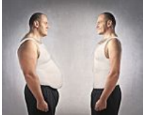
3 Ways To Lose 20lbs. Quickly Hot Topic