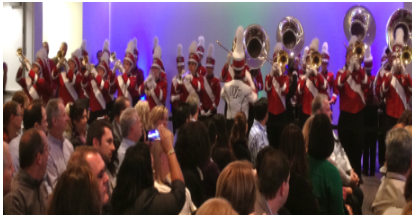
Whippany Park High School Marching Band